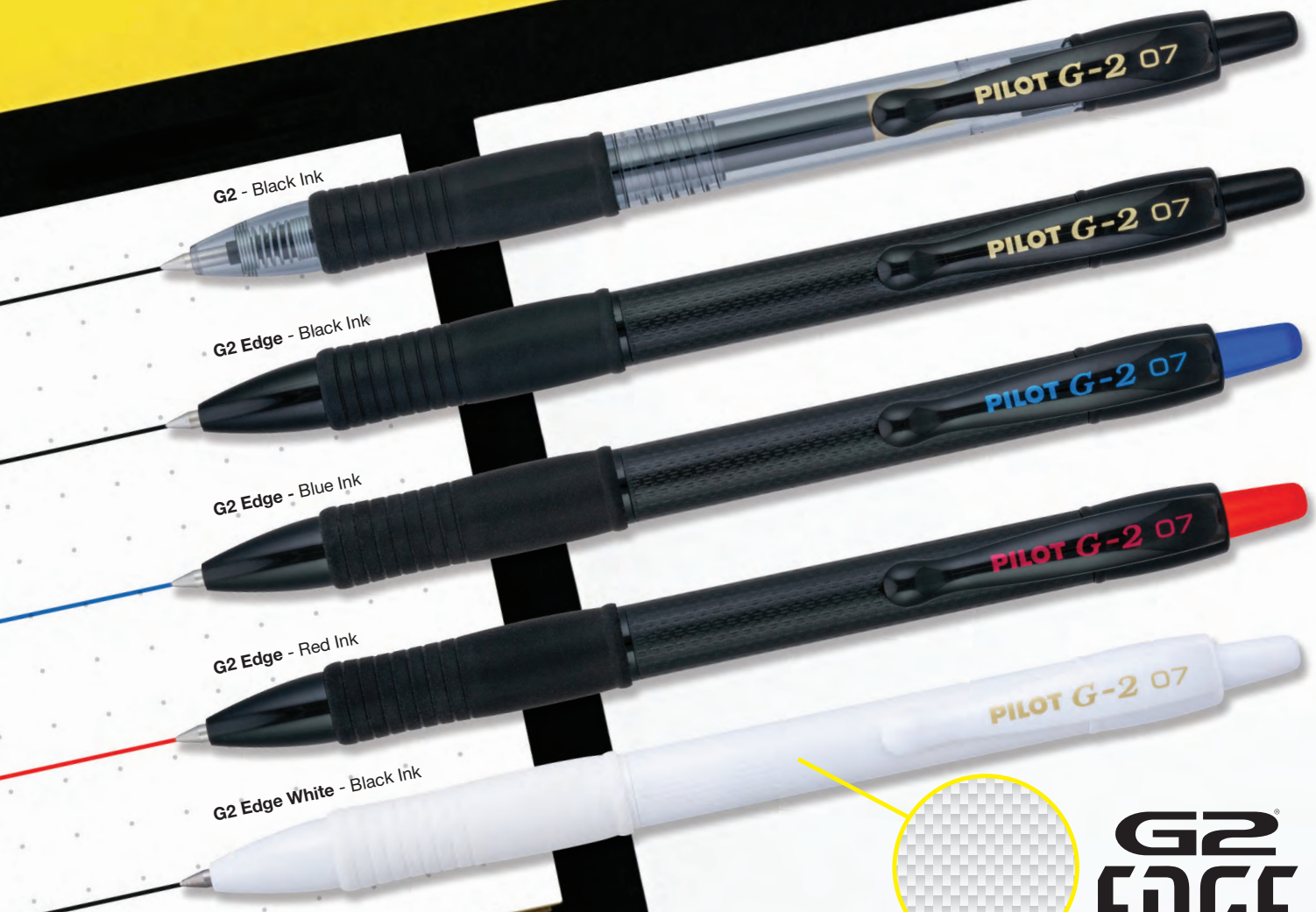
G2 - Black Ink